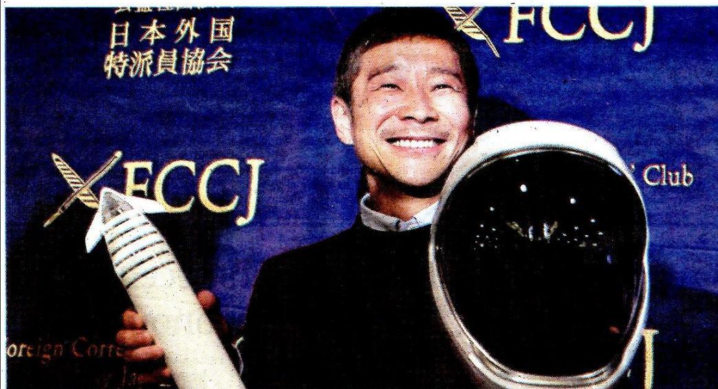
Maezawa poses with a miniature rocket and space helmet at the Foreign Correspondents' Club of Japan in Tokyo yesterday.

TOKYO — Billionaire Japanese tycoon and future space tourist Yusaku Maezawa's training to go to the moon should not be too tricky, he joked yesterday, adding he planned to use free time from his six-hour work day to squeeze it in.