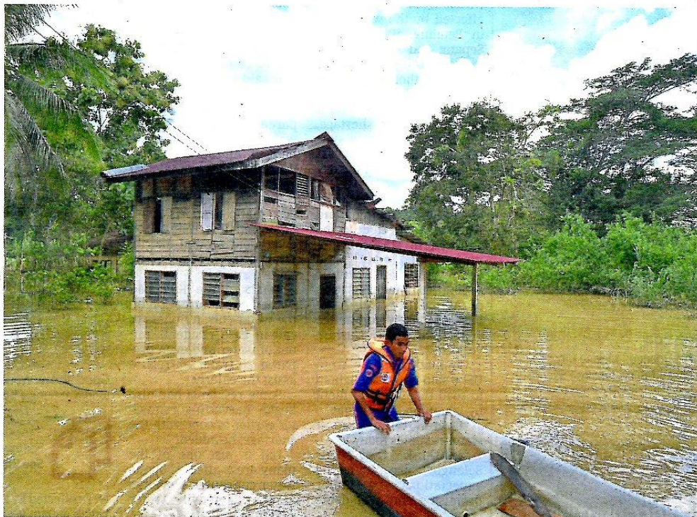
Water woes: A Kubang Pasu Civil Defence Force personnel pushing a boat at Kampung Lubuk Batu, Kubang Pasu in Kedah.

"We are monitoring the situation and will carry out more evacuations, if necessary," he said.