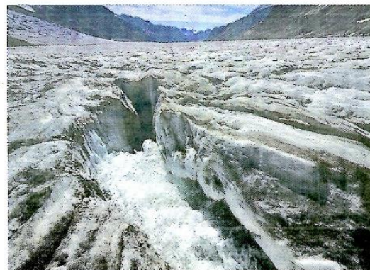
Water from a melting glacier runs down through a hole in the Aletsch Glacier in Switzerland. The UN climate change report says to prevent 2.7 degrees of warming, greenhouse pollution must be reduced by 45 per cent from 2010 levels by 2030, and 100 per cent by 2050.

To prevent 2.7 degrees of warming, the report said, greenhouse pollution must be reduced by 45 per cent from 2010 levels by 2030, and 100 per cent by 2050. It also