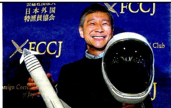
Skyward bound: Maezawa posing with a miniature rocket and space helmet prior to the start of the press conference at the Foreign Correspondents' Club of Japan in Tokyo.

"I was formerly known as 'Maezawa the fashion guy' and now its been updated to 'Maezawa, who's going to the moon'," he said.